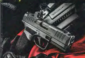
SPRINGFIELD HELLCAT PRO COMP