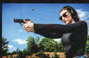
EAA GIRSAN MC14 BDA