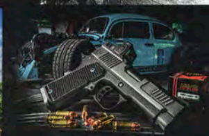
NIGHTHAWK CUSTOM COUNSELOR