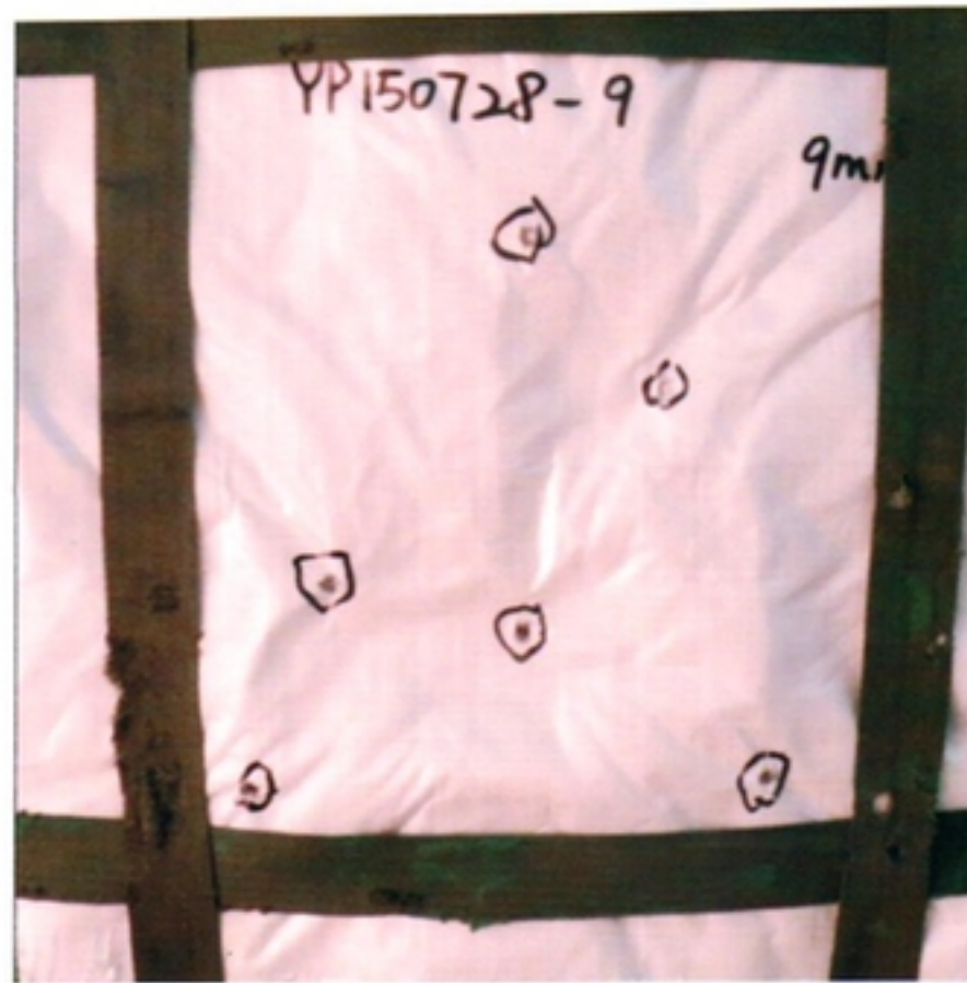
Picture 1 Impact Side