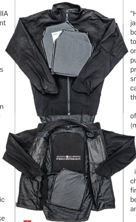
↑ The Peacemaker's ballistic panels are easily removable, and the jacket is machine washable to ensure simple cleaning and maintenance.

One neat feature of the Peacemaker jacket is its